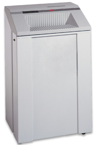
W/D/H 70 x 55 x 112 cm