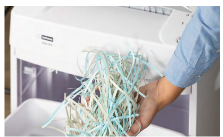
4 mm stripes with security level P-2 according to DIN 66399 (ISO/IEC 21964).