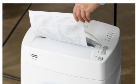
Shreds documents with paper clips and staples.