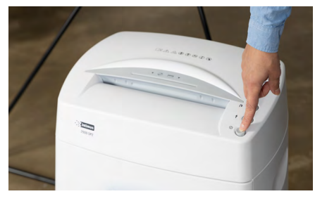
Automatic start/stop function and anti-paper jam technology.