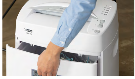
Removable 32-litre collection bin for easy disposal.