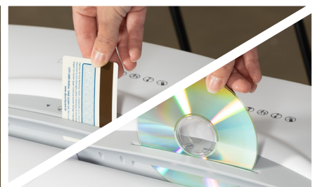
Credit cards and CDs can also be shredded via a separate feeding slot.