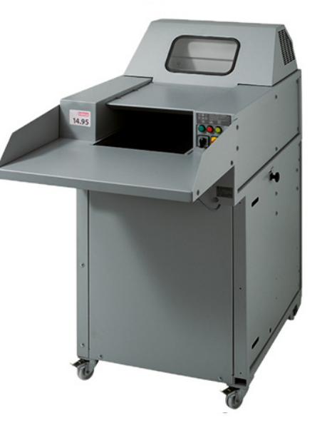
W/D/H 80/120 x 168 x 164 cm