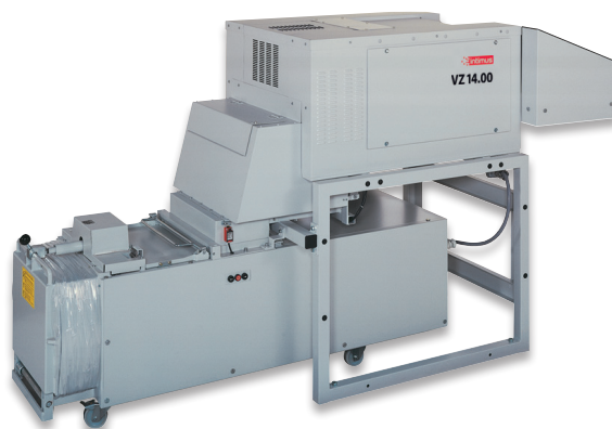
W/D/H 305 x 120 x 168 cm

For decades, the intimus® heavy duty shredders have proven to be centrally positioned pieces of equipment for the privacy-friendly disposal of disused media. The model range offers variations that can handle up to 550 sheets/h in a single operation. The spacious feed table with integrated infeed conveyor belt provides controlled, effortless, safe and fast loading. The shredded material is collected in large-scale, mobile or swing-out containers under the cutting mechanism.