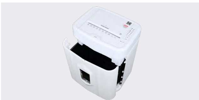
Pull-out 20-litre collection bin.