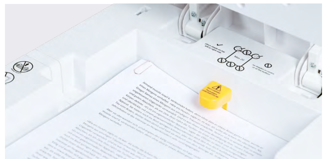
Also shreds documents with paper clips and staples.