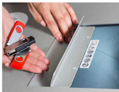
SSDs, USB sticks, SD cards, and plastic cards are rendered unusable