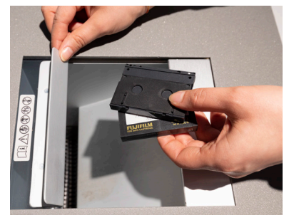
Small magnetic tapes, as well as CDs, DVDs and Blu-rays are shredded