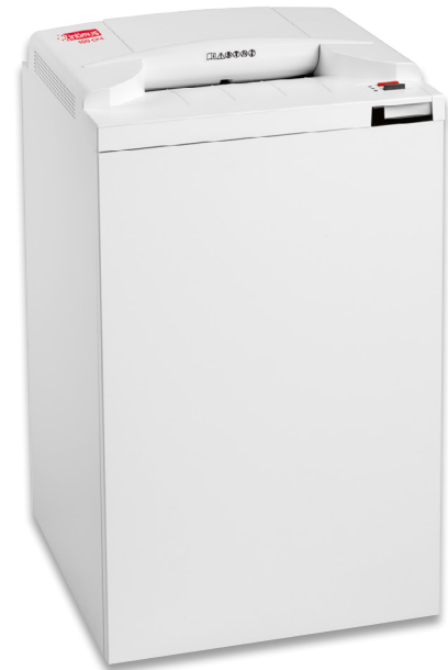
W/D/H 49 x 44 x 90 cm